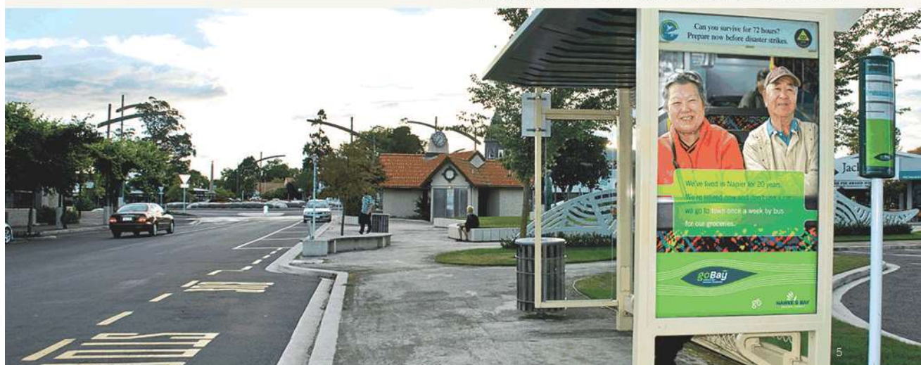
REGIONAL PUBLIC TRANSPORT PLAN 2019 - 2029

Principles of the Public Transport Operating Model (PTOM) have been incorporated into the LTMA. PTOM is a system for planning, procuring and funding public transport. It aims to increase patronage with less reliance on public subsidies, through better collaboration between operators and regional councils. PTOM requires all bus services to be divided into units and provided under exclusive contracts to HBRC. However, services which do not form part of the core public transport network are exempt from operating under contracts.