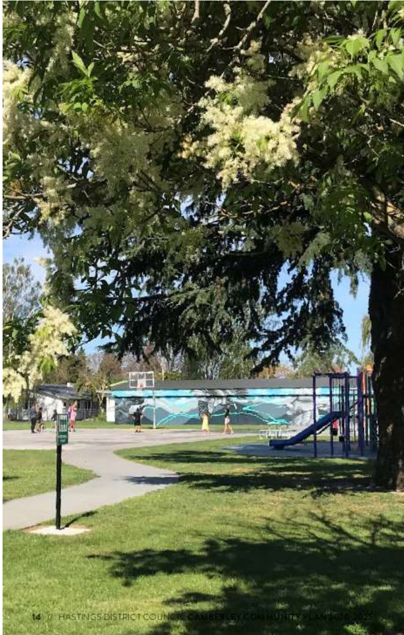
14 // HASTINGS DISTRICT COUNCIL CAMBERLEY COMMUNITY PLAN 2020-2025