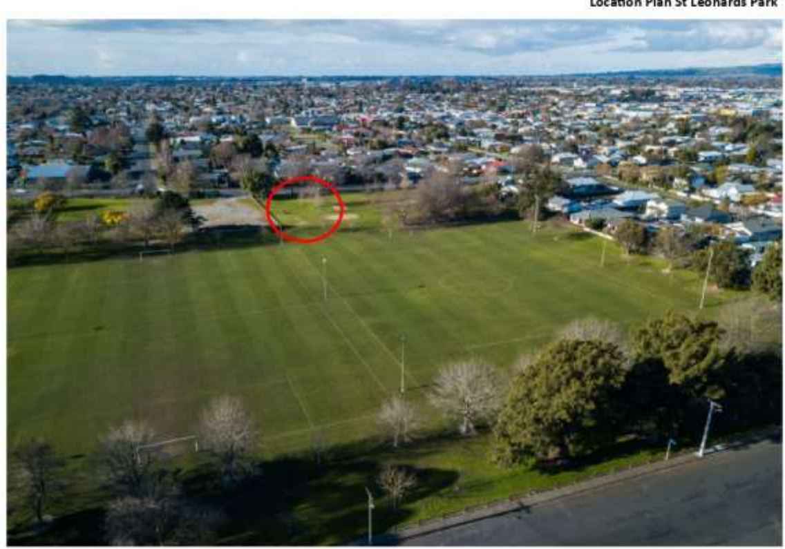
Attachment 2 Location Plan St Leonards Park