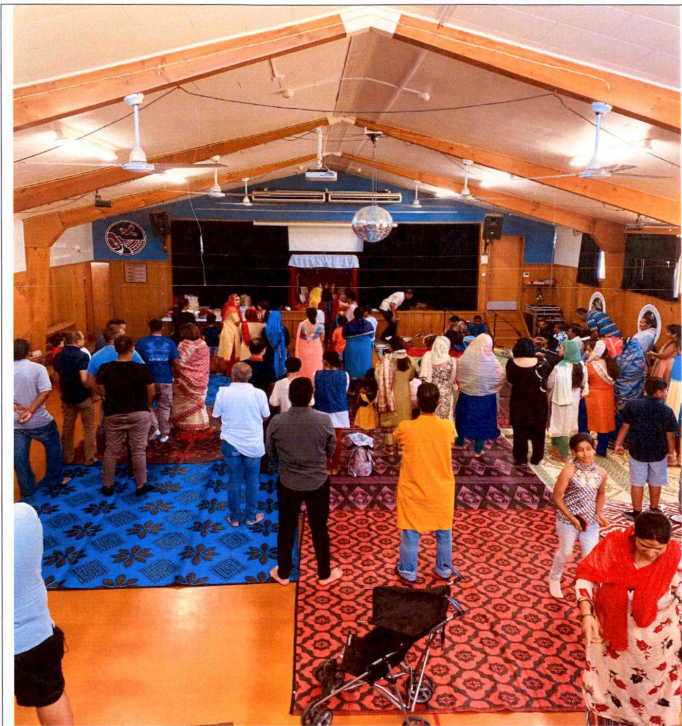
Proposal by Hindu Council of Hawke’s Bay for a Hindu Community Centre, May 2024 hchawkesbay@gmail.com