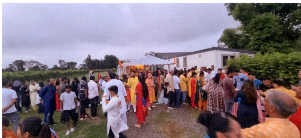
Ganesh Utsav 2023