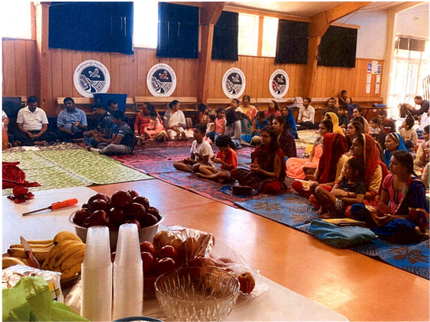
Ramayana Katha 2021

Proposal by Hindu Council of Hawke's Bay for a Hindu Community Centre, May 2024 hchawkesbay@gmail.com