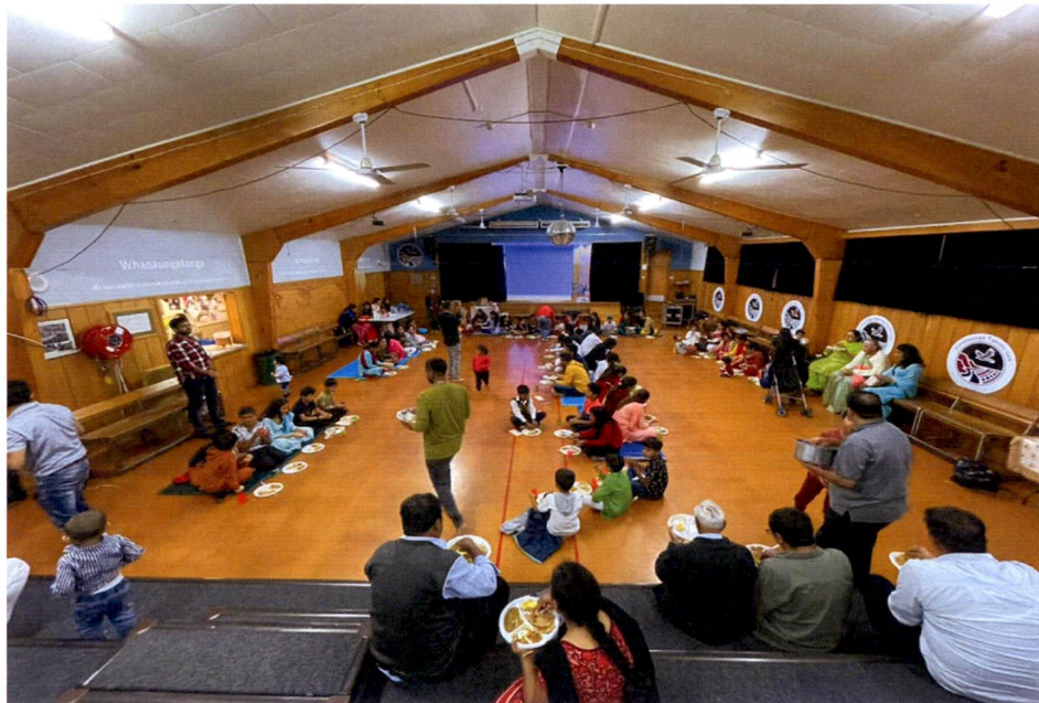
Ram Navami 2021

Proposal by Hindu Council of Hawke's Bay for a Hindu Community Centre, May 2024 hchawkesbay@gmail.com