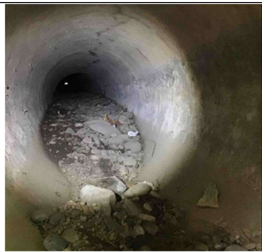
Ngatarawa Rd – Sign repair