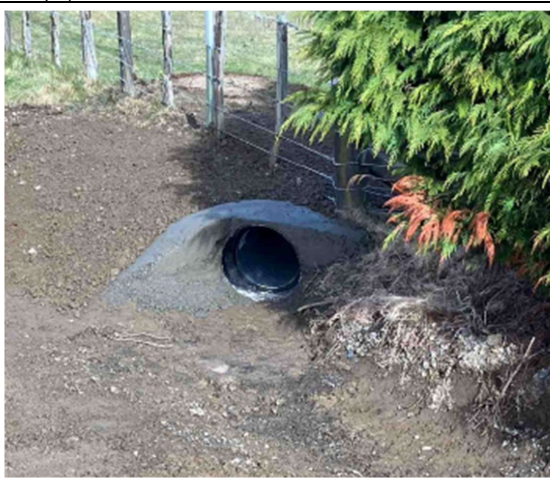
Darky Spur Rd - Headwall