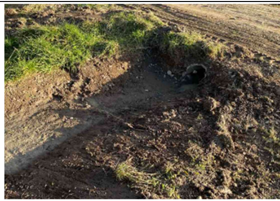
Pakaututu Rd – Watertabling