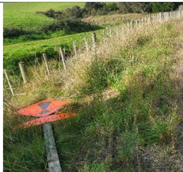
Heays Access Rd – Annual bridge maintenance