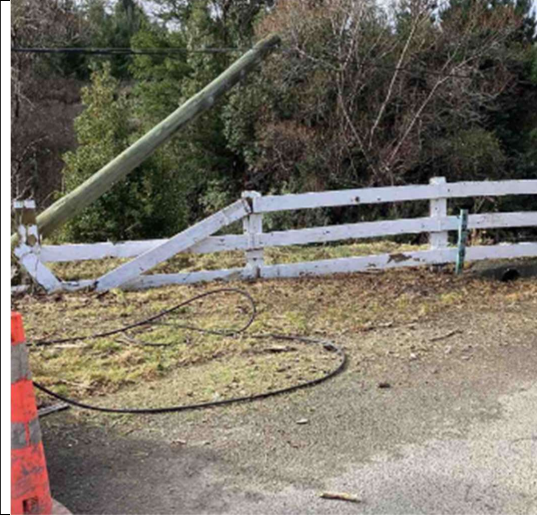
Mangelton Rd - Watertable