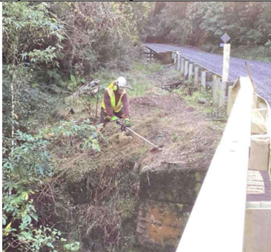
B# 219 Hukanui – Annual bridge maintenance