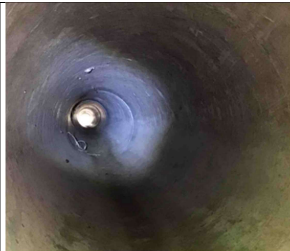
Ngatarawa Rd – Sign repair