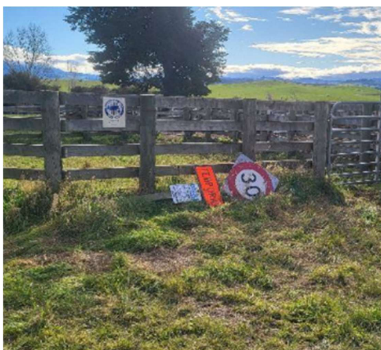
Heays Access Rd – Annual bridge maintenance