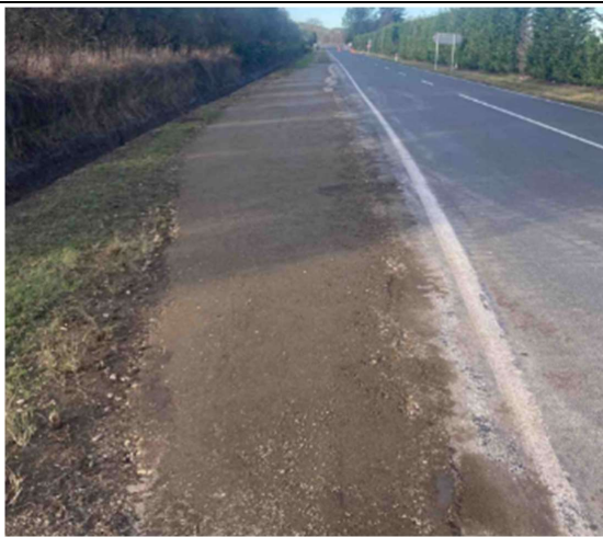
Dartmoor Rd – Stop Bay