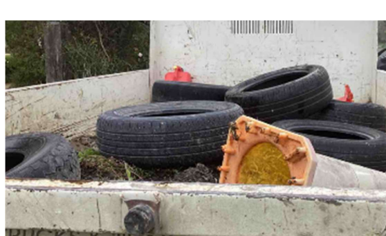
Waimarama Rd – Litter