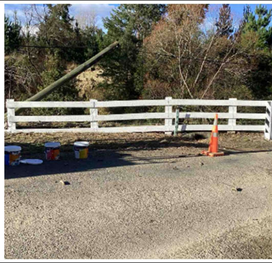
Mangelton Rd - Watertable