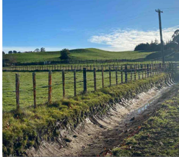
Waihau Rd – Clear watertable