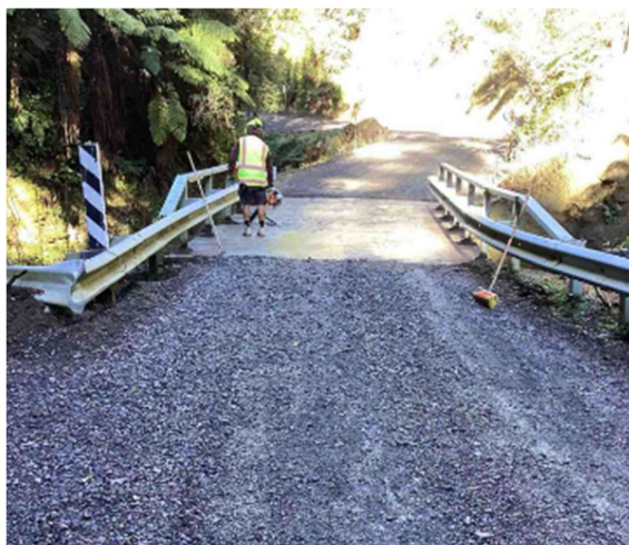
B# 219 Hukanui – Annual bridge maintenance