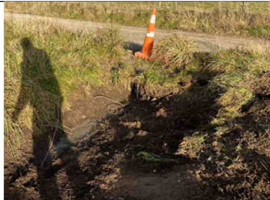
Pakaututu Rd – Watertabling