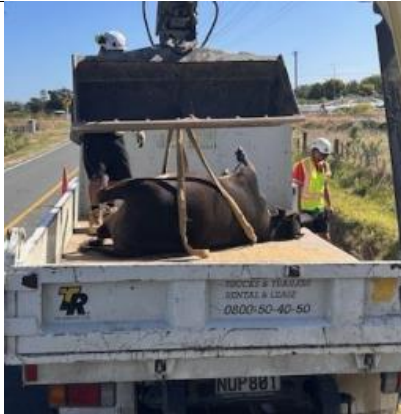
Te Aute Rd: Clear cow carcass