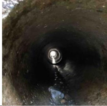
Ridgemount Rd: Flushing