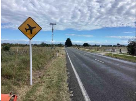
Ngatarawa Rd: Sign Installation