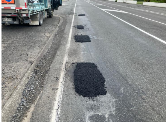
Maraekakaho Rd W: AC Repair