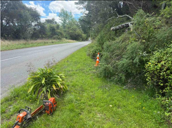
Puketitiri Rd: Fallen Tree Removal