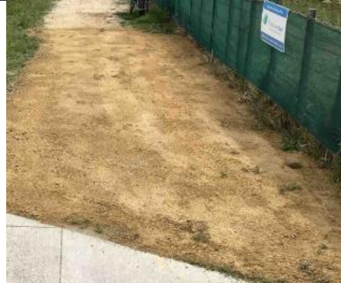
Ngatarawa Rd: Footpath