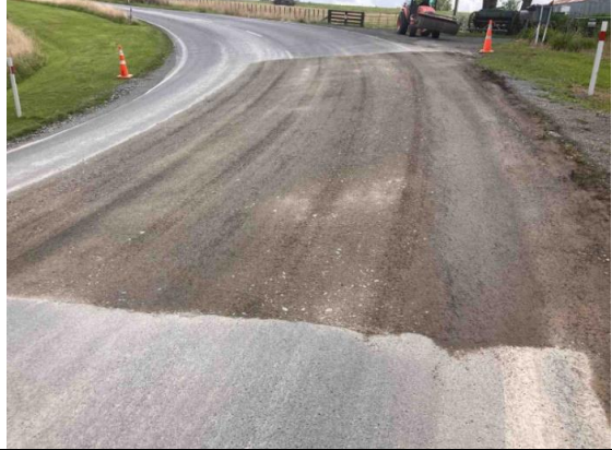
Taihape Rd: Stabilisation