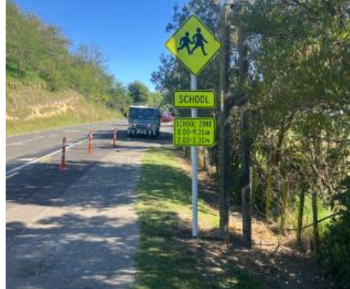
Puketapu Rd: Sign Installation