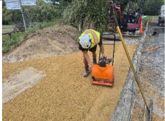
River Rd: Limesand Footpath Maintenance