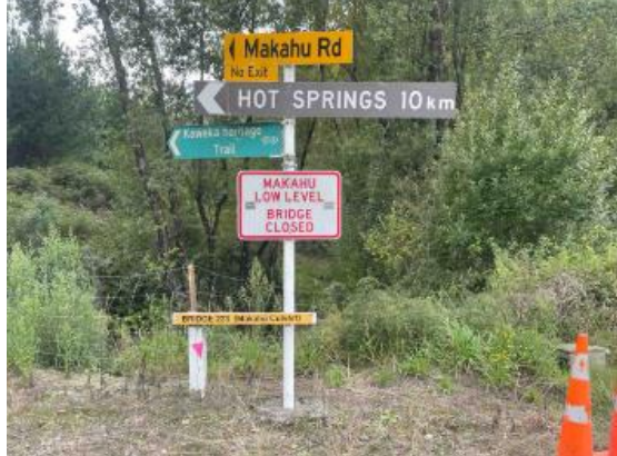
Makahu Rd: Sign Installation