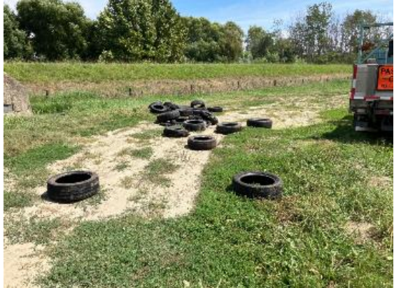
Dartmoor Rd: Litter Collection