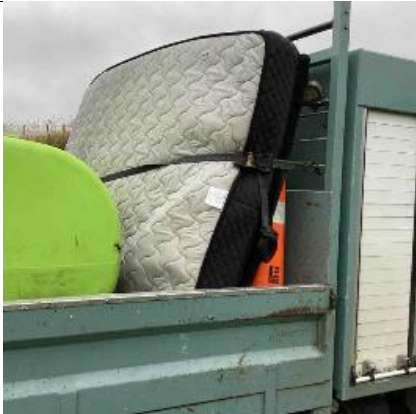
Taihape Rd: Clear mattress