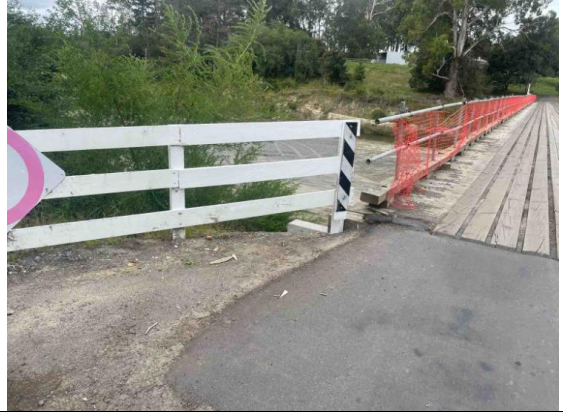
Dartmoor Rd: Sight Rail Repair