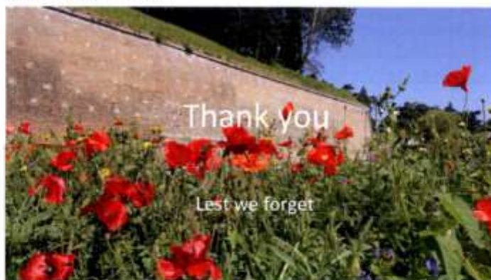
Rt Hon Sir Don McKinnon ONZ GCVO Chairman New Zealand Memorial Museum Trust

Thank you for the opportunity to make this submission which we hope will be favourably considered.