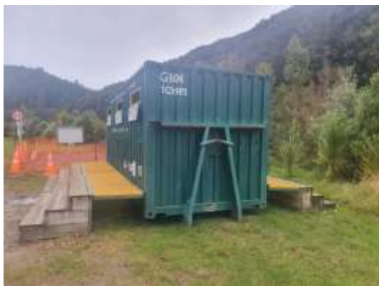
Progress Update as at 16 May